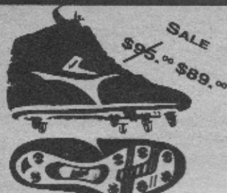
HUSTLER Size 7-15