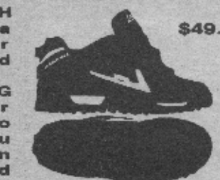
UNTOUCHABLE Champion Size 6-13 1/2