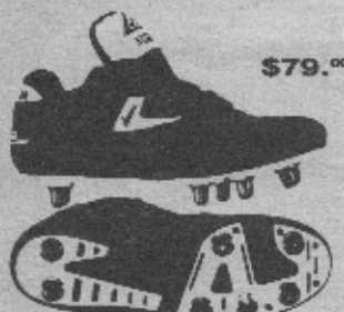
AGGRESSOR Size 7-14