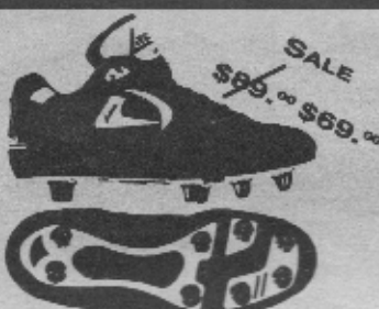
IMPACT Size 7-15