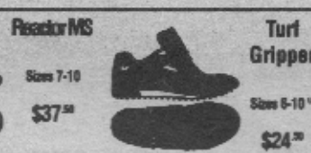
Reactor MS Size 7-10